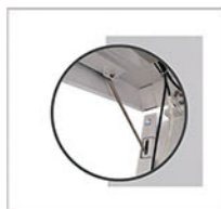
Iron hook support rod for panel support