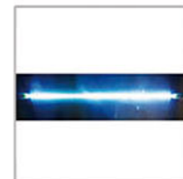
UV Lamp Emission of 253.7 nanometers for most efficient decontamination.