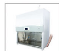
Cabinet Support Block Easy to lift, prevent hand pressing