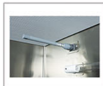
Wind Speed Sensor & EC Fan