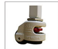
Footmaster Caster Universal caster with brake and leveling feet.