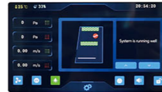
Color Touch Screen Touch operation, real-time and clearer display of various values and appointment timing function.